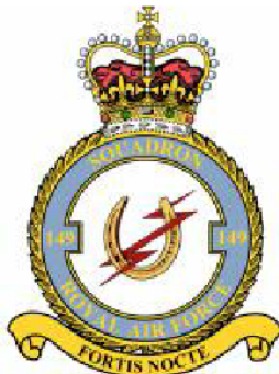
Badge of 149 squadron RAF

Francis is remembered on both local war memorials and also at the IBCC at Lincoln in phase 2 panel 188.