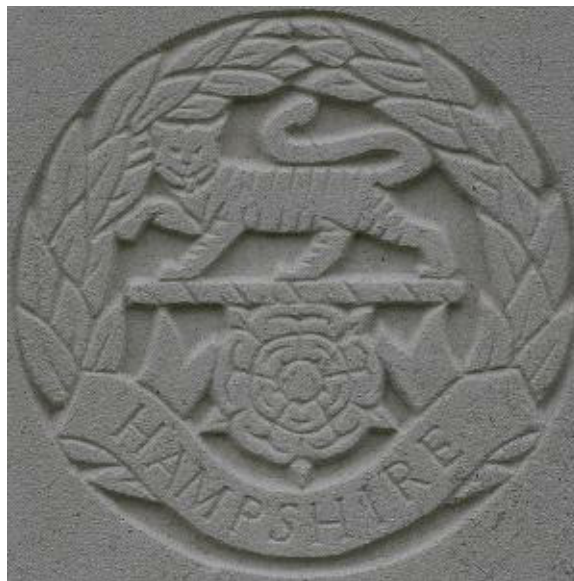
Badge of the Royal Hampshire Regiment as depicted on a CWGC gravestone