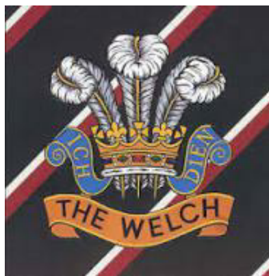
Badge from the Welch Regiment as depicted on an embroidered tie

Edwin died on 09/09/1944. A site for a cemetery, the Coriano Ridge War Cemetery, was selected in April 1945 and those soldiers who had been buried in outlying areas were brought in to the new cemetery. Edwin is buried in plot XX.L.8 and is also remembered on both local war memorials.