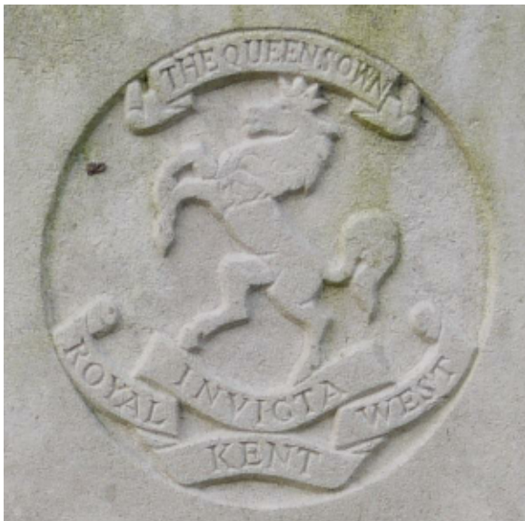
Badge of the Royal West Kent Regiment as depicted on a CWGC gravestone

He is remembered on both local memorials, the Army roll of honour, the roll of honour of King's School Canterbury and the Lloyds of London Memorial.