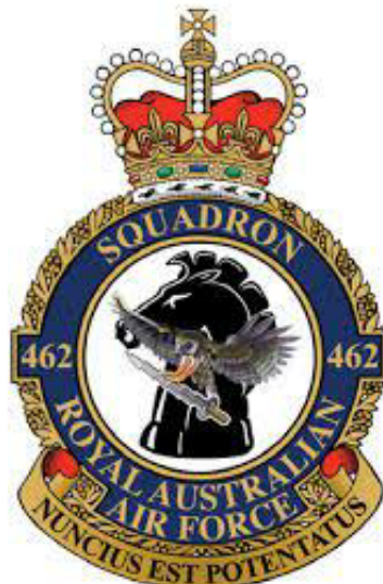
Badge of 462 squadron as part of the RAAF