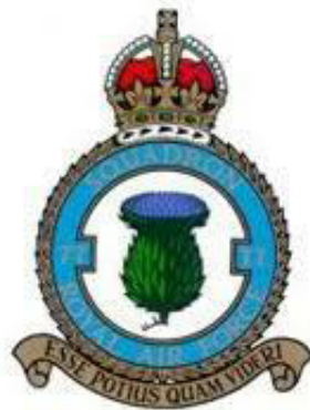
Badge of 77 squadron RAF

Ray is remembered on both local war memorials and on the IBCC at Lincoln in phase 2 panel 194.