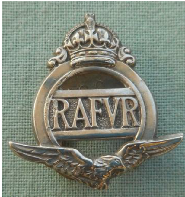
RAFVR lapel badge

Joseph is buried in The Downs Cemetery in Brighton in section X.D grave 638. Lilian remained living in the village and died here in 1970.