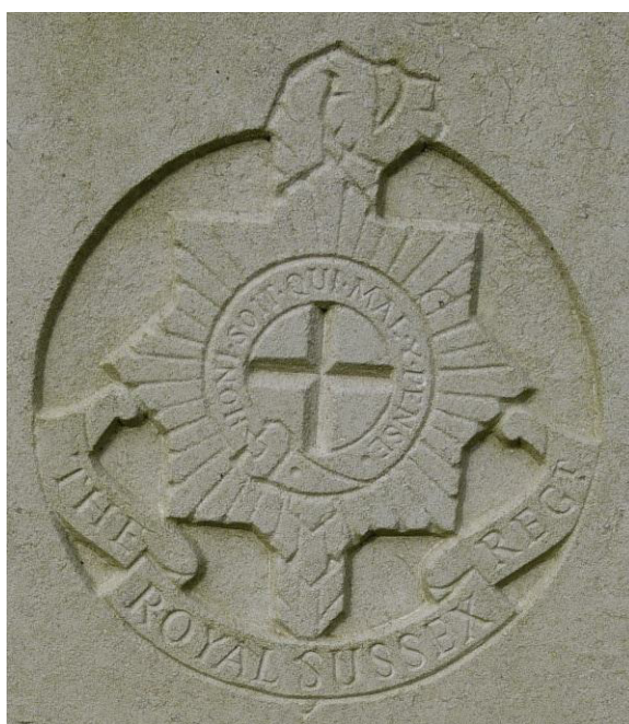
Badge of the Royal Sussex Regiment as depicted on a CWGC gravestone.