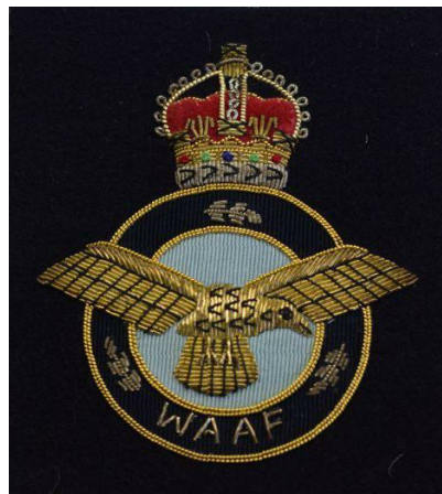
WAAF blazer badge

Her death was registered in Nuneaton but she was buried in Sayers Common in a privately registered CWGC grave. No grave number is given as hers is the only WW2 CWGC grave in the cemetery. She is remembered on the Sayers Common war memorial as well as on both local war memorials.